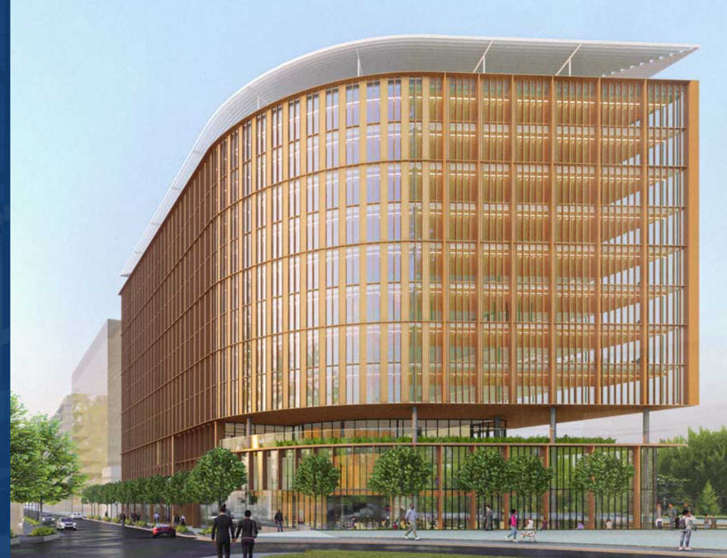
The Douglass | Residential Under Construction